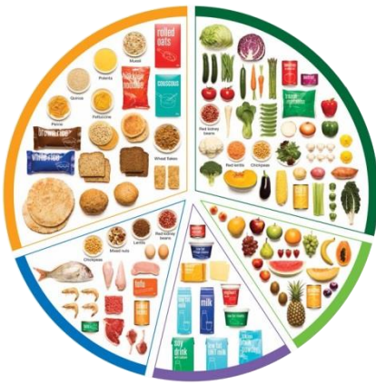
The five core food groups, taken from the Australian Guide to Healthy Eating 8 .

Find out more about the five core food groups at